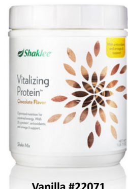
Vanilla #22071 Chocolate #22072

Celebrating 100 years of innovation with 3 more BLOCK BUSTER Products