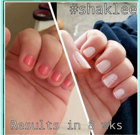
results in 8 weeks