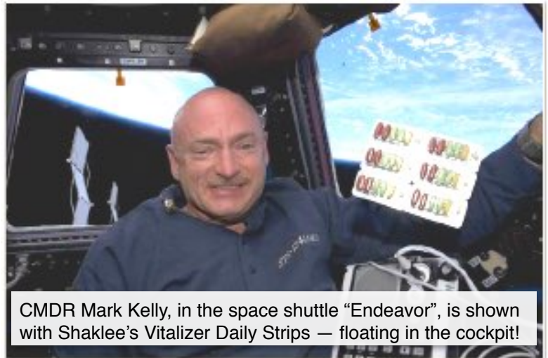
CMDR Mark Kelly, in the space shuttle "Endeavor", is shown with Shaklee's Vitalizer Daily Strips — floating in the cockpit!